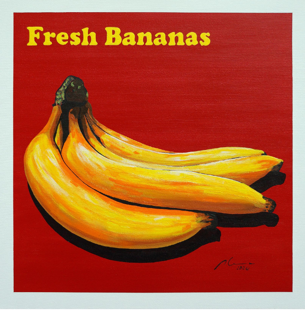
Marwan Chamaa, "Fresh Bananas", 2024, acrylic on canvas, 60.96 x 60.96 cm (24 x 24 inch)