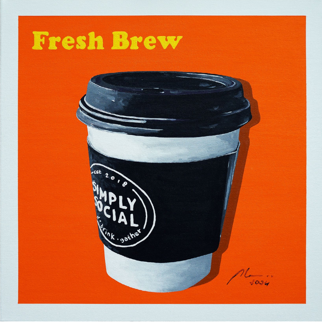
Marwan Chamaa, "Fresh Brew", 2024, acrylic on canvas, 60.96 x 60.96 cm (24 x 24 inch)