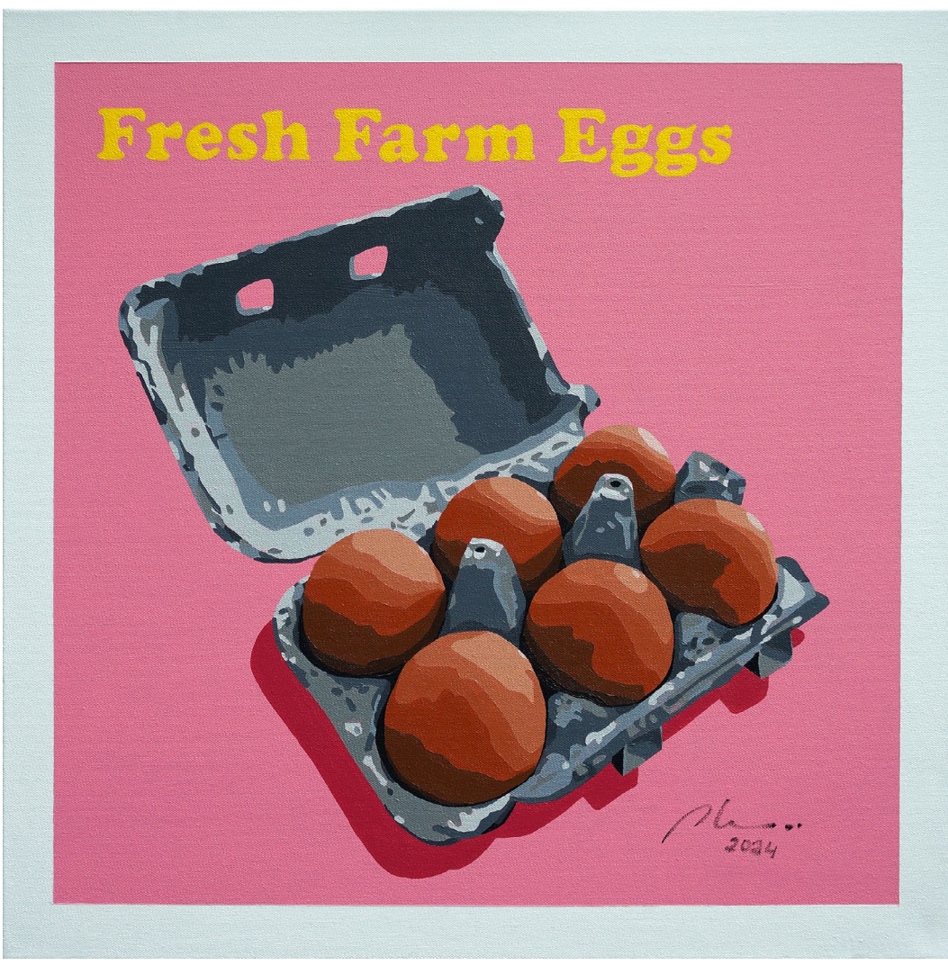
Marwan Chamaa, "Fresh Eggs", 2024, acrylic on canvas, 60.96 x 60.96 cm (24 x 24 inch)