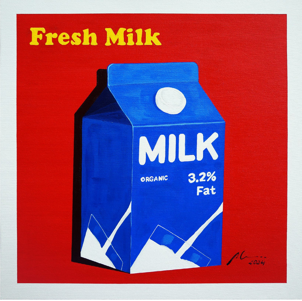
Marwan Chamaa, "Fresh Milk", 2024, acrylic on canvas, 60.96 x 60.96 cm (24 x 24 inch)