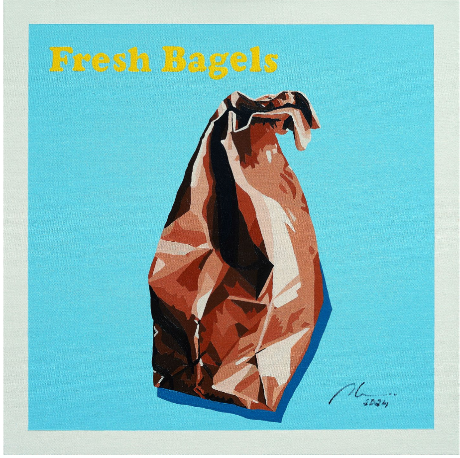
Marwan Chamaa, "Fresh Bagels", 2024, acrylic on canvas, 60.96 x 60.96 cm (24 x 24 inch)