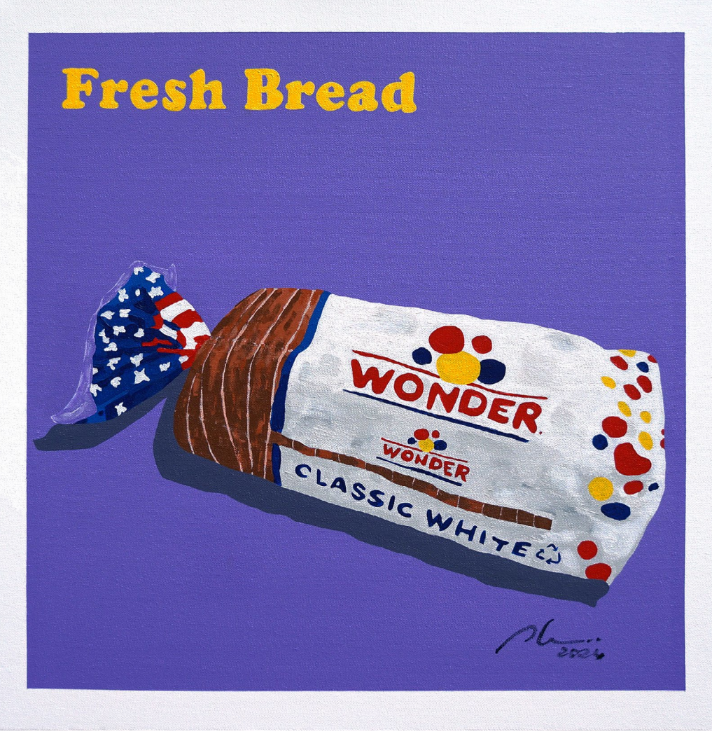
Marwan Chamaa, "Fresh Bread", 2024, acrylic on canvas, 60.96 x 60.96 cm (24 x 24 inch)